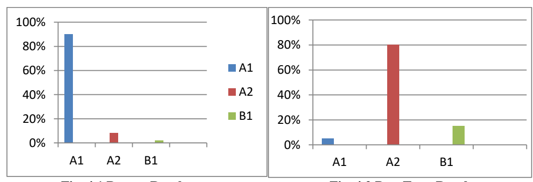
Fig. 4.1 Pretest Results

The quantitative analysis are represented in the following bar graphs. The pretest results (fig. 4.1) showed that 90% of the students were on A1 level, 7% A2 and 3% B1 level. The posttests results (fig. 4.2) revealed that the students in the experiment group A1 decreased to 5%, A2 level increased to 80% and B1 level increased to 18%. Therefore, teaching students how and when to use relevant speech acts in appropriate contextual situations developed their communicative skills as the result of the development their high order thinking skills.